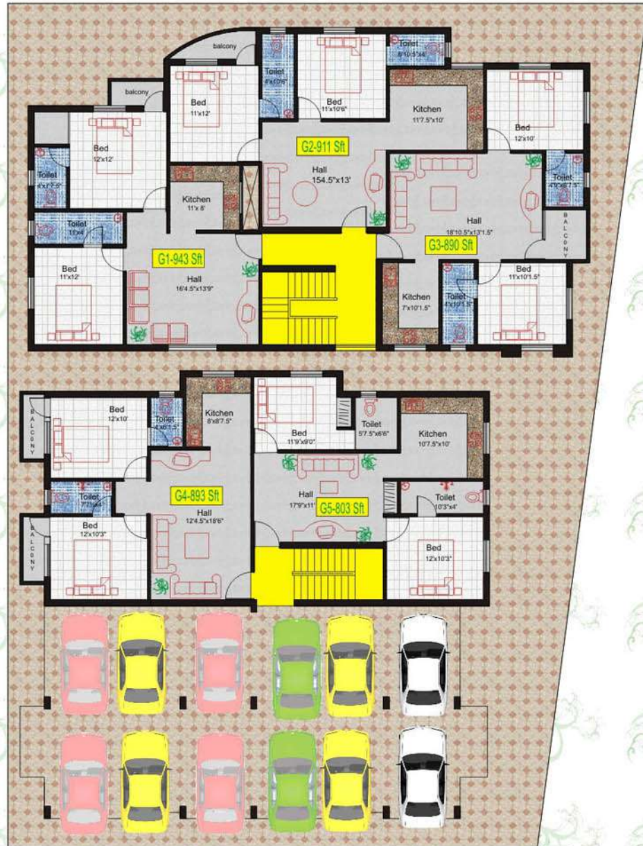
SITE / STILT CUM GROUND FLOOR PLAN