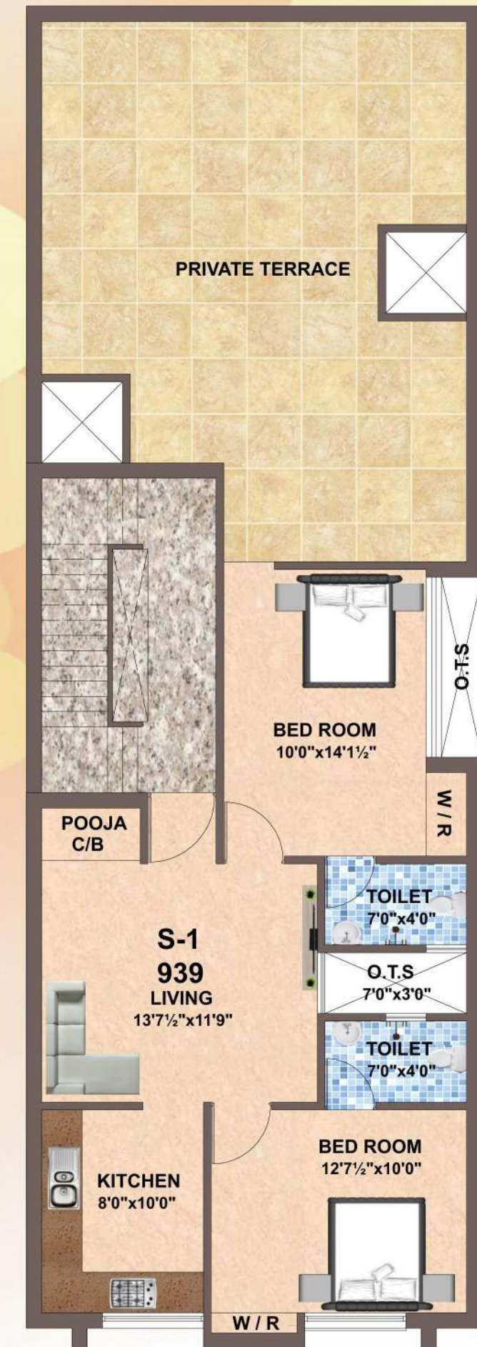
Second floor plan