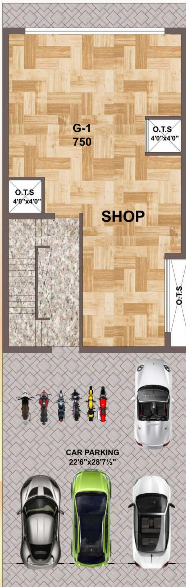
Site cum ground floor plan